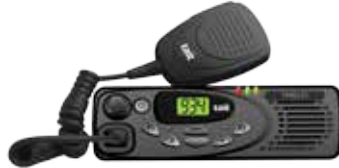
TM8235 3-digit display Up to 100 conventional channels