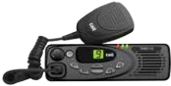
TM8110 1-digit display 10 channels