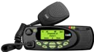
TM8250 4-line display 1,500 channels