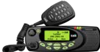
TM8255 4-line display Up to 1,500 conventional channels