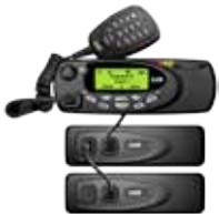
TM8260 Dual band 1,500 channels