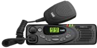
TM8115 2-digit display 100 channels