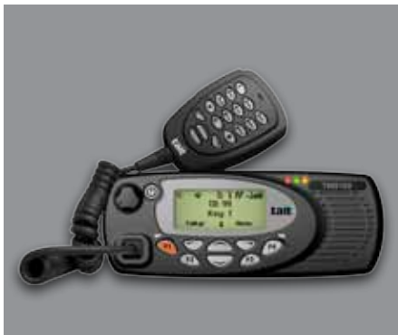
TM9155 mobile radio