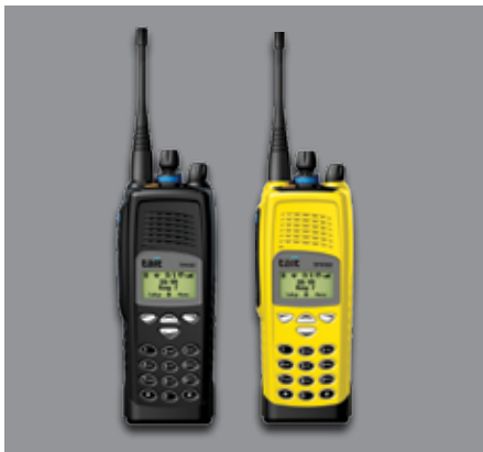
TP9100 portable radios

Tait is solely focused on radio communications and specializes in the unique needs of Public Safety agencies. Tait continues to stand shoulder-to-shoulder with our Public Safety customers, ultimately resulting in safer citizens, empowered officers and greater community trust.