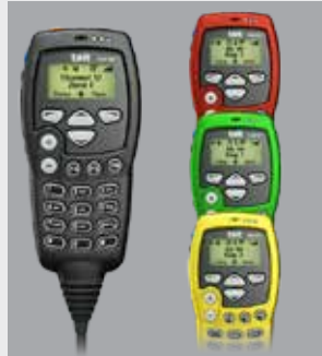
Hand-held control head (HHCH)