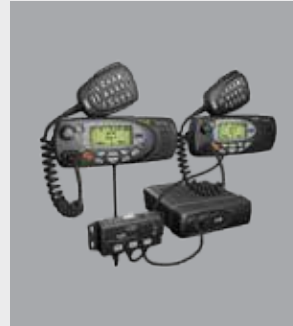
Dual head configuration