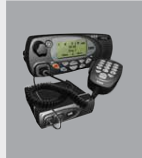
Remote head configuration