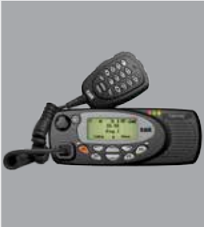
Standard control head